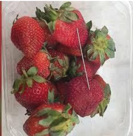
2016 – La Costeña - Mexico 2018 – Morangos - Austrália