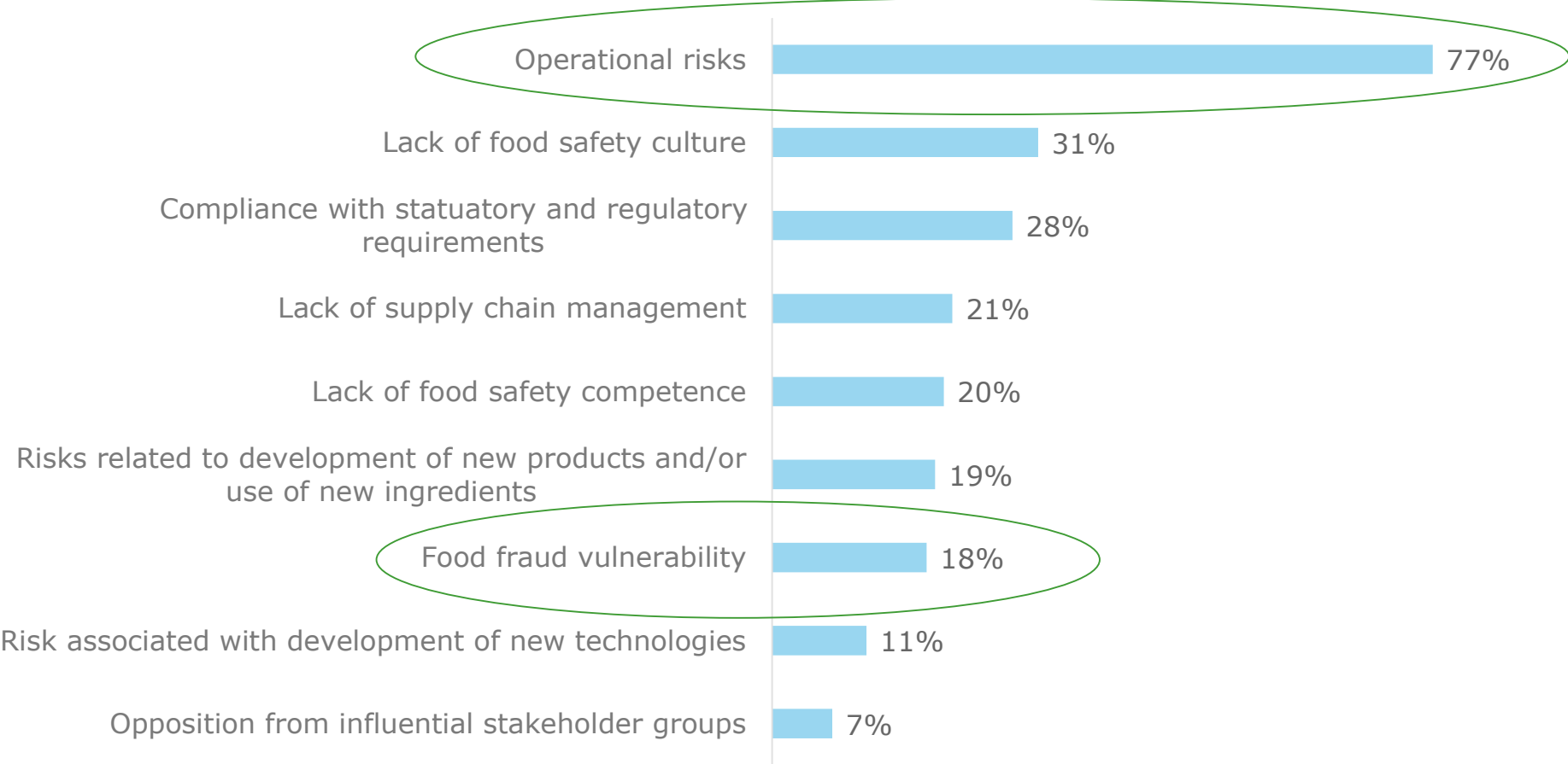
% Main Risks